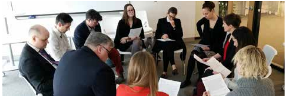
A group of Senior School administrators and faculty work together to refine their Touchstones discussion leadership skills.